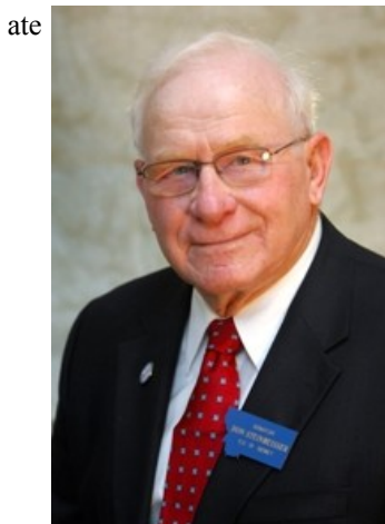
Senator Don Steinbeisser

During the 2009 legislature there was, however, a flip side to the menacing right-to-work coin. Senate Bill 339 by Greg Hinkle, R-